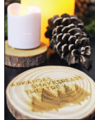
Patrons received handmade disks as a thank-you for their support.